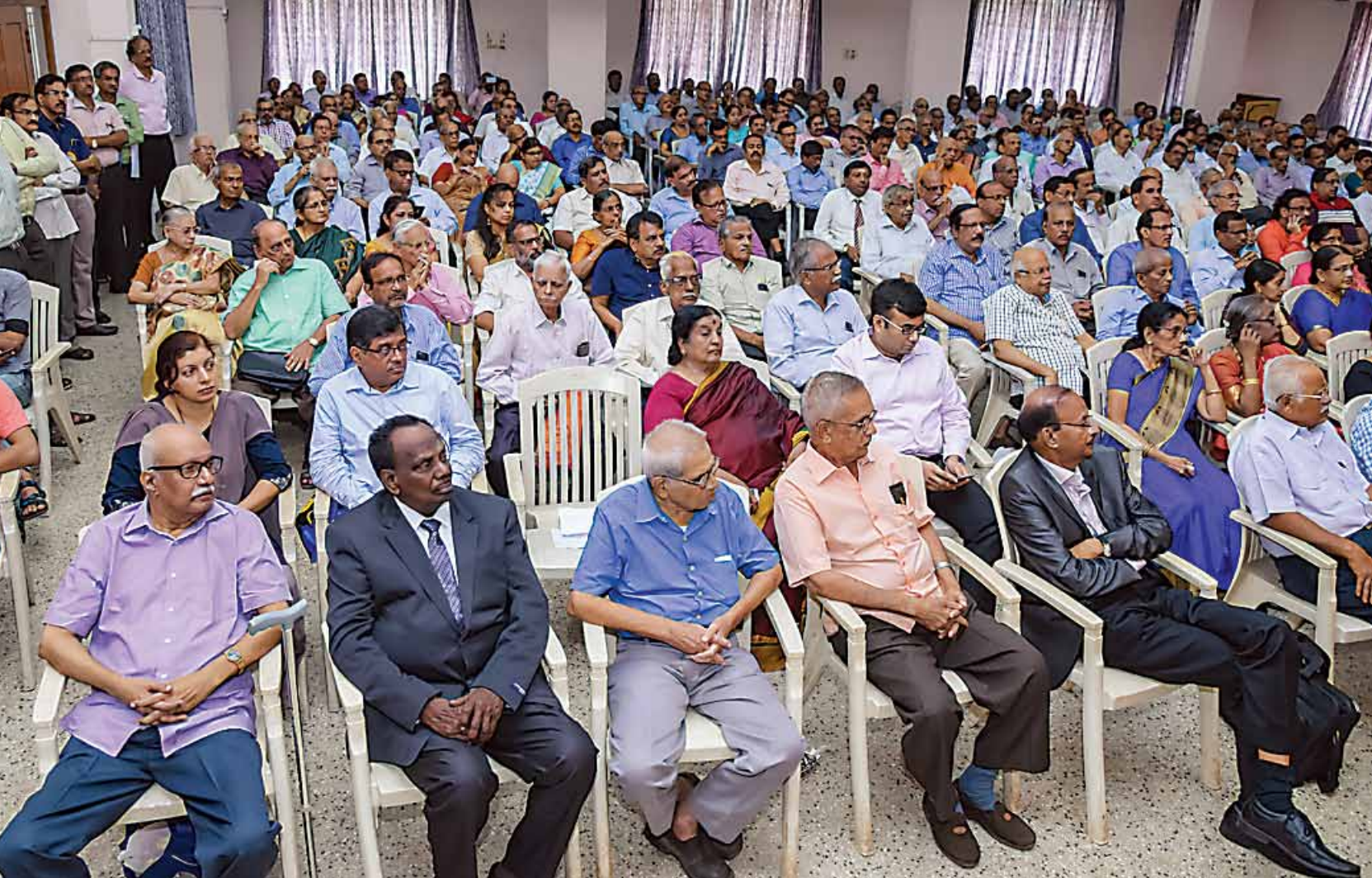
THEY MADE IT A GRAND SUCCESS A VIEW OF THE GATHERING