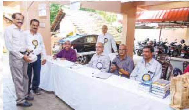
Volunteers at work at reception counter