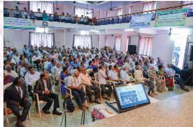
Members watching the features of new website on the screen