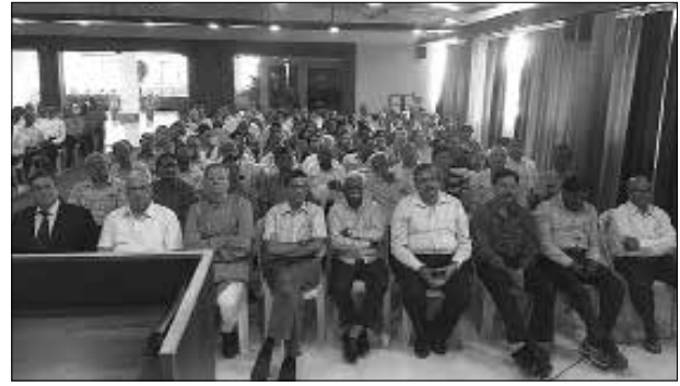
A view of the gathering