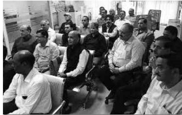
A view of the gathering