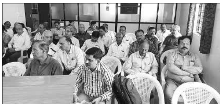
A view of the gathering