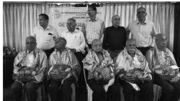
Octogenarians alongwith dignitaries after the felicitations