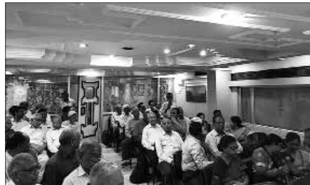
A view of the Gathering